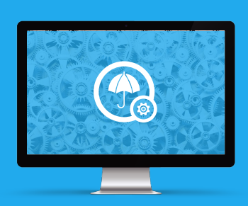
Risk Engine API (stateless)